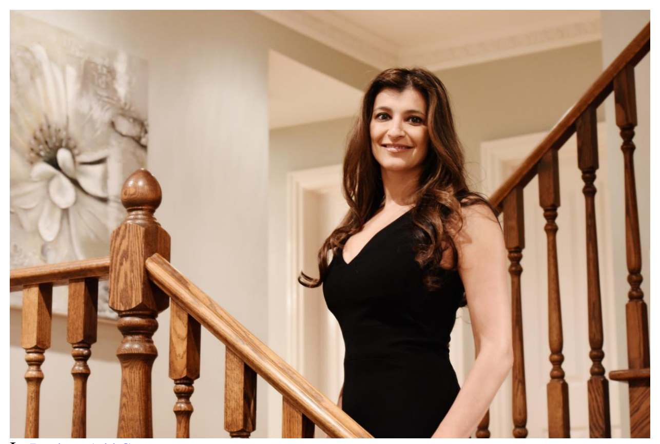
In Books • Add Comment

There's this <u>person</u> I look up to, one I secretly think is not a human but a machine. Not only does she have three kids, but she is a published author, an expert in her field both on television and print, one of Toronto's most popular influencer, and immensely respected by her peers. Which is why I think she is also secretly a robot, because how does one person accomplish all this and still look so put together and drop dead gorgeous?